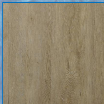
GREY BIRCH + 2MM PAD