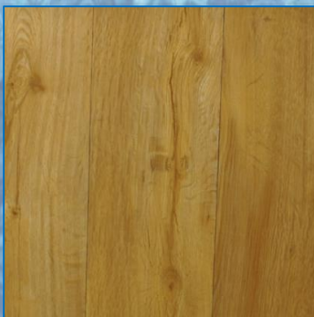
SPICE PECAN + 2MM PAD