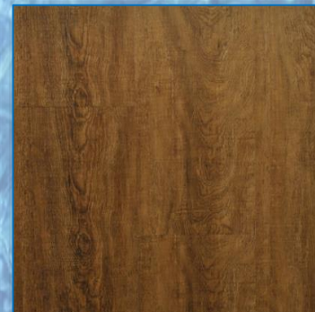
URBAN WALNUT + 2MM PAD